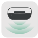
Wide detection range

Covers larger areas, reducing the number of deployed sensors and lowering enterprise costs.