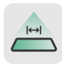
Customizable detection area

Covers larger areas, reducing the number of deployed sensors and lowering enterprise costs.