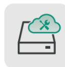
Cloud device management

Supports temperature, humidity, and illumination in meeting rooms, enabling data reporting and integration strategies.